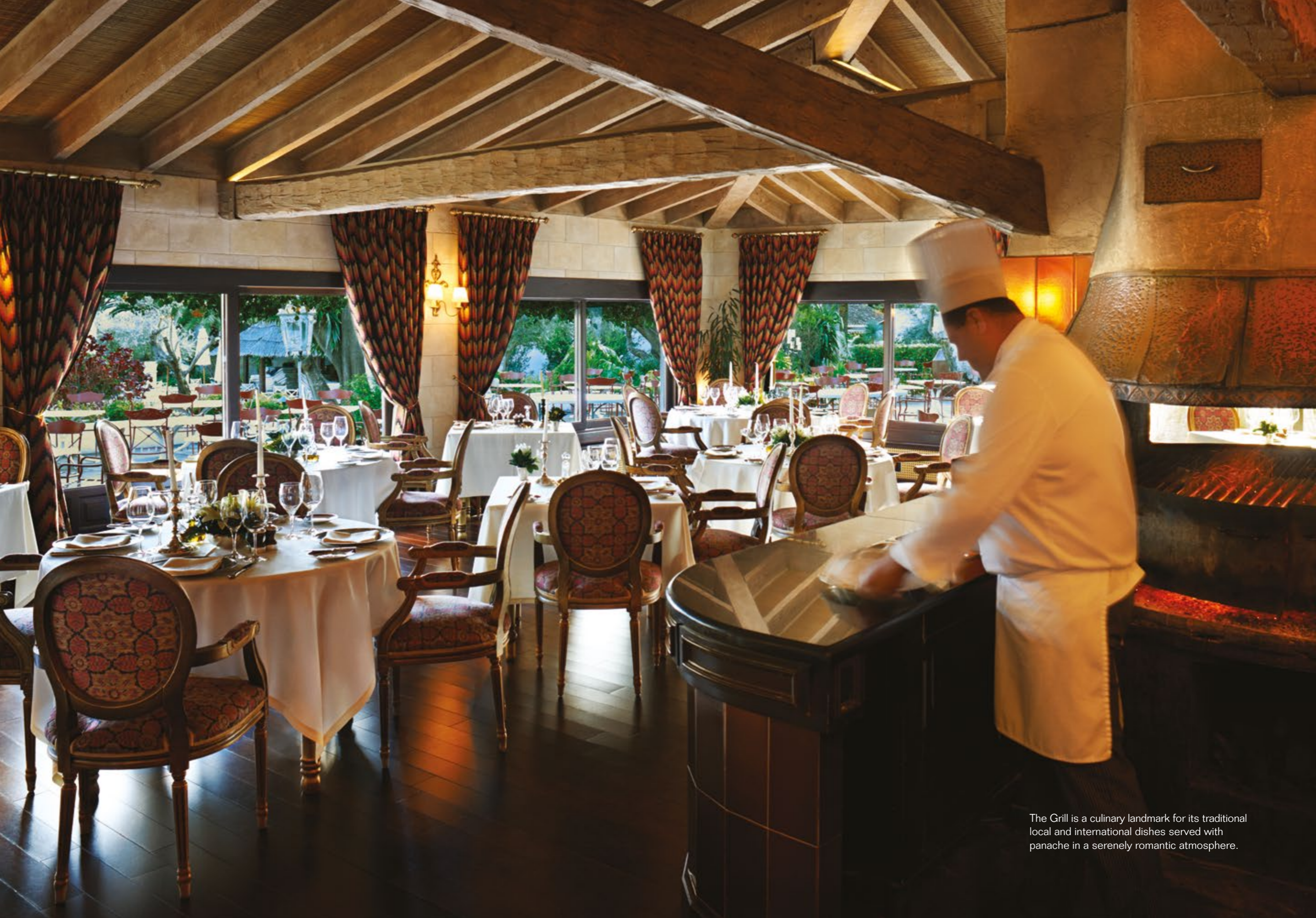
The Grill is a culinary landmark for its traditional local and international dishes served with panache in a serenely romantic atmosphere.