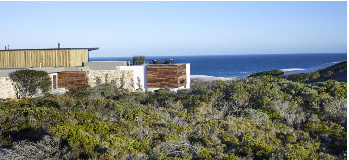
Morukuru Beach Lodge site and view