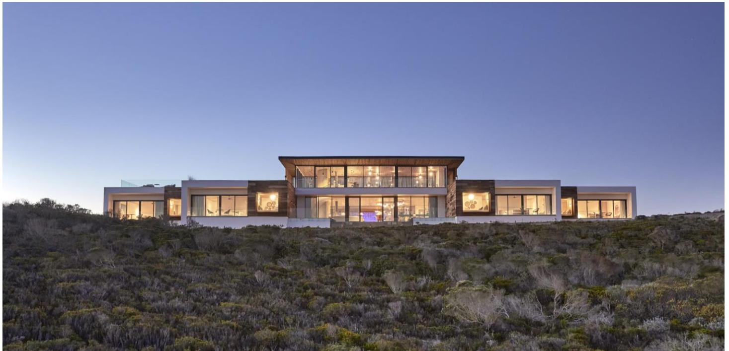
Morukuru Beach Lodge, surrounded by Fynbos